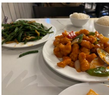
Sautéed spicy string beans and sweet and sour chicken.

Moon Kee, 2642 Broadway; (646)-438-9283; http://moonkeerestaurant.com ; Open M-F 11:30 a.m.-10 p.m., Sa/Su 11 a.m.-10 p.m.